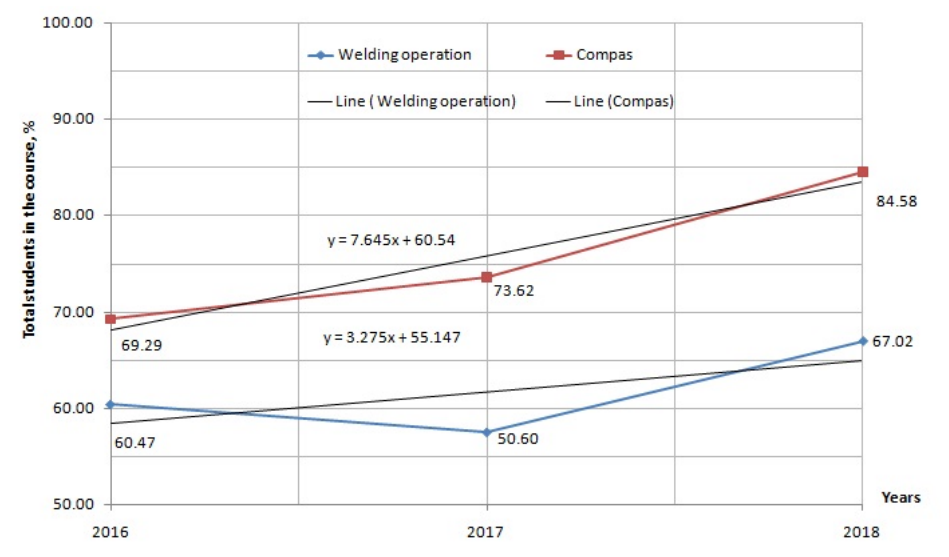
Fig. 4. Student interest and motivation trend

The analysis of the obtained data showed existence of increase in interest and motivation to practical training for the first year students in 2018, in comparison with control 2016 and 2017, on average for 12.75 % annually, and the second-year students - on average for 5.75 % (Fig. 4).