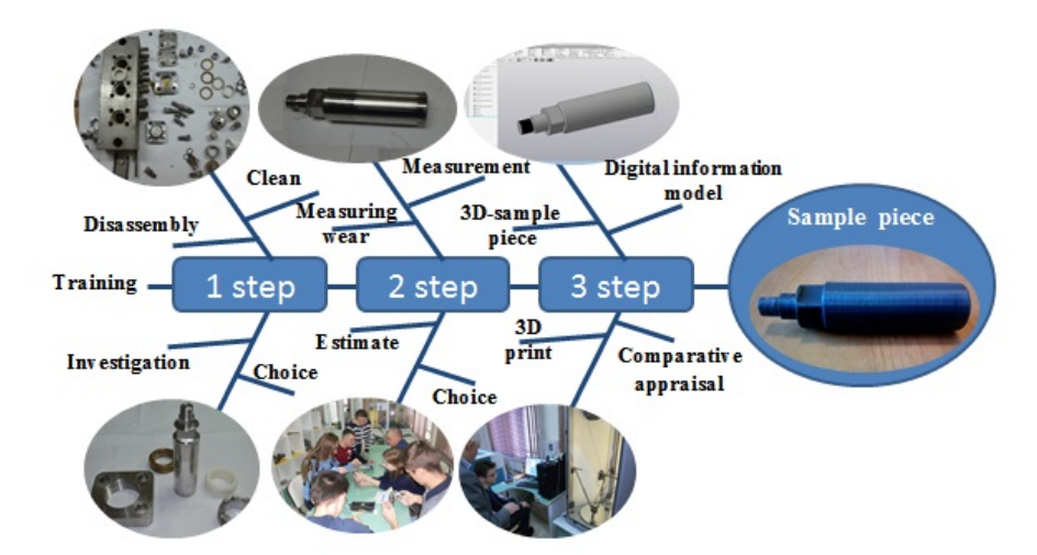
Fig. 1. Additive technology training

In the future additional trainings and master classes are organized for consolidation of knowledge. There are used additive technologies in the design of agricultural machines and technological equipment of processing plants. That all allows to apply the accumulated knowledge. Trainings are conducted according to the following scenario. The first preparatory stage is disassembling and cleaning. Research and choice of problem parts requiring additional study is carried out (Fig. 1). The second stage is micrometric and other measurements, preliminary assessment and final selection of the part. At the third stage the part in Compas-3D package is modeled, if necessary, complementing with a digital information model. The resulting model is printed using a 3D-printer. Comparative evaluation of the resulting model is done.