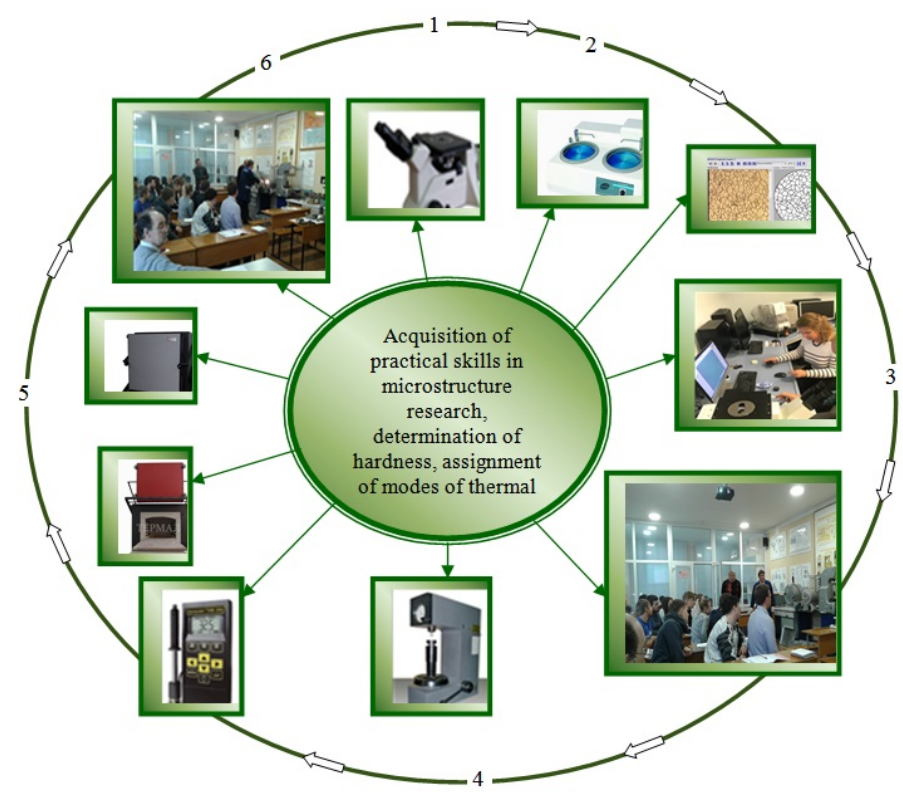
Fig. 2. Master classes and equipment for practical skills in discipline "Material Science and Technology of Structural Materials" (stages 1-6)

The next step in end-to-end design and production is to study the basics of material science and the technology of structural materials (Fig. 2). In order to implement the practical component, master classes and trainings are held to study the microstructure of the material, determine the hardness and technology of thermal treatment processes of machine parts [6; 9; 13].